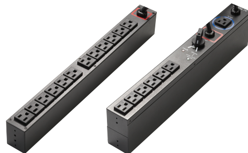
Optional FlexPDU and HotSwap MBP for greater flexibility and uptime