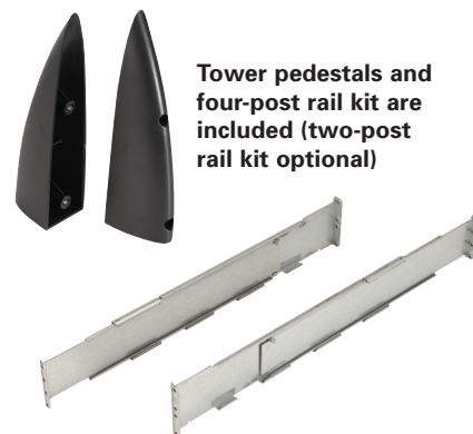
Tower pedestals and four-post rail kit are included (two-post rail kit optional)