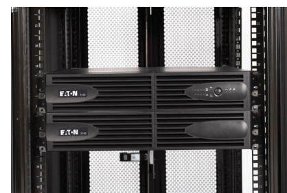
2U rackmount model with 2U EBM—add up to four EBMs for hours of runtime